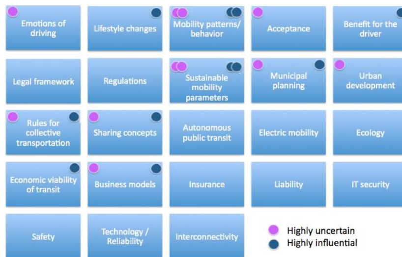
Fig. 1: Influential factors identified and expert evaluations

vehicles. The spectrum of 23 influential factors that were identified consisted of issues such as regulation, politics, city development, technological development, the viability and organization of mobility and transportation options, societal factors, human behavior regarding mobility, as well as acceptance of autonomous systems. Furthermore, factors such as IT security, liability questions, insurance, system interconnectivity, and reliability were also addressed. The latter factors were not delved into further in the process, since they are outside the realm of what municipal legislation can organize and influence. Also, the decision was based on the assumption that the corresponding regulations and parameters for autonomous driving will exist by 2035 or even earlier. The factors with the highest degree of relevance for the future development of autonomous vehicles in the city were selected by experts according to the uncertainty of how they would develop over time and according to how strongly they would influence autonomous driving in the city.